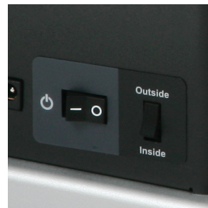
Rewinding direction switch to rewind "inside or outside" label rolls