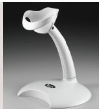
> AS-8000 stand