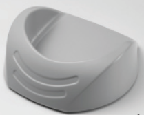
> AS-8000 holder