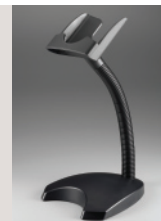
> AS-8120 stand